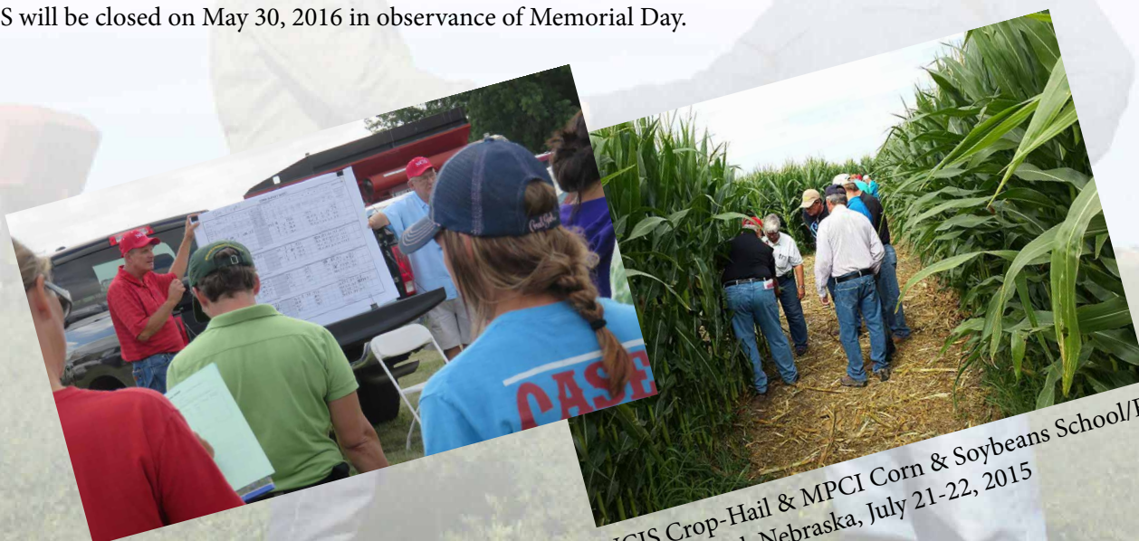
NCIS Crop-Hail & MPCCI Corn & Soybeans School/Field Day, Grand Island, Nebraska, July 21-22, 2015

NCIS will be closed on May 30, 2016 in observance of Memorial Day.